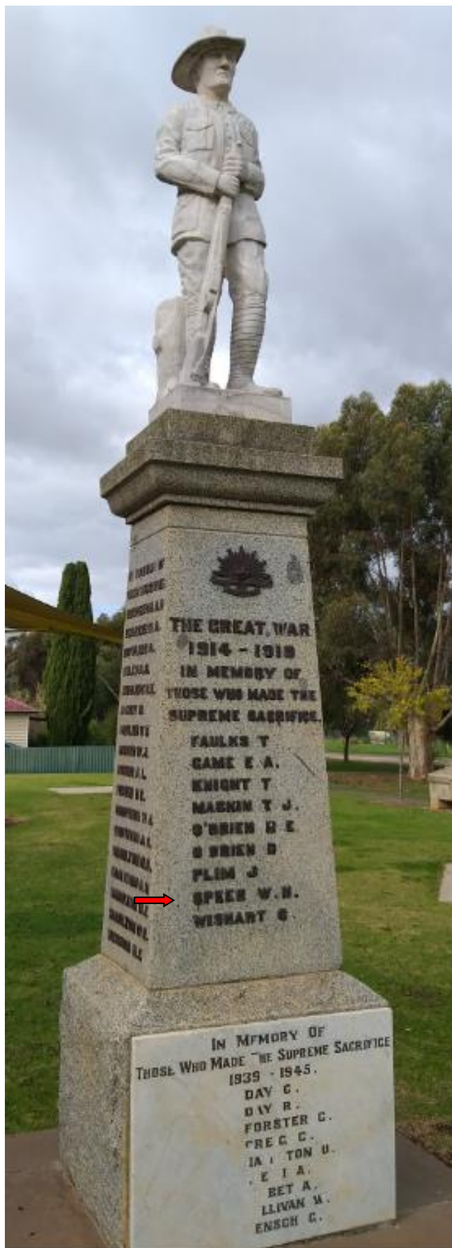
Korong Vale War Memorial