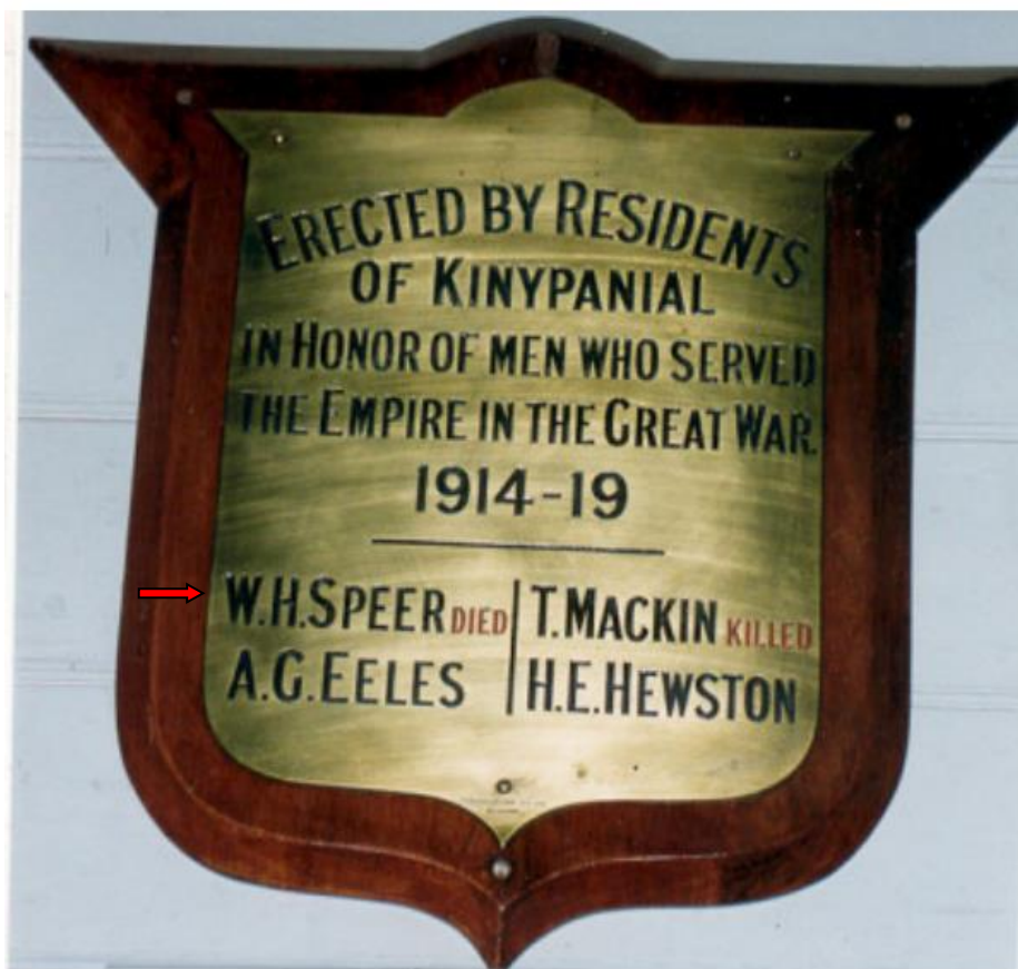
Kinypanial School Honour Roll