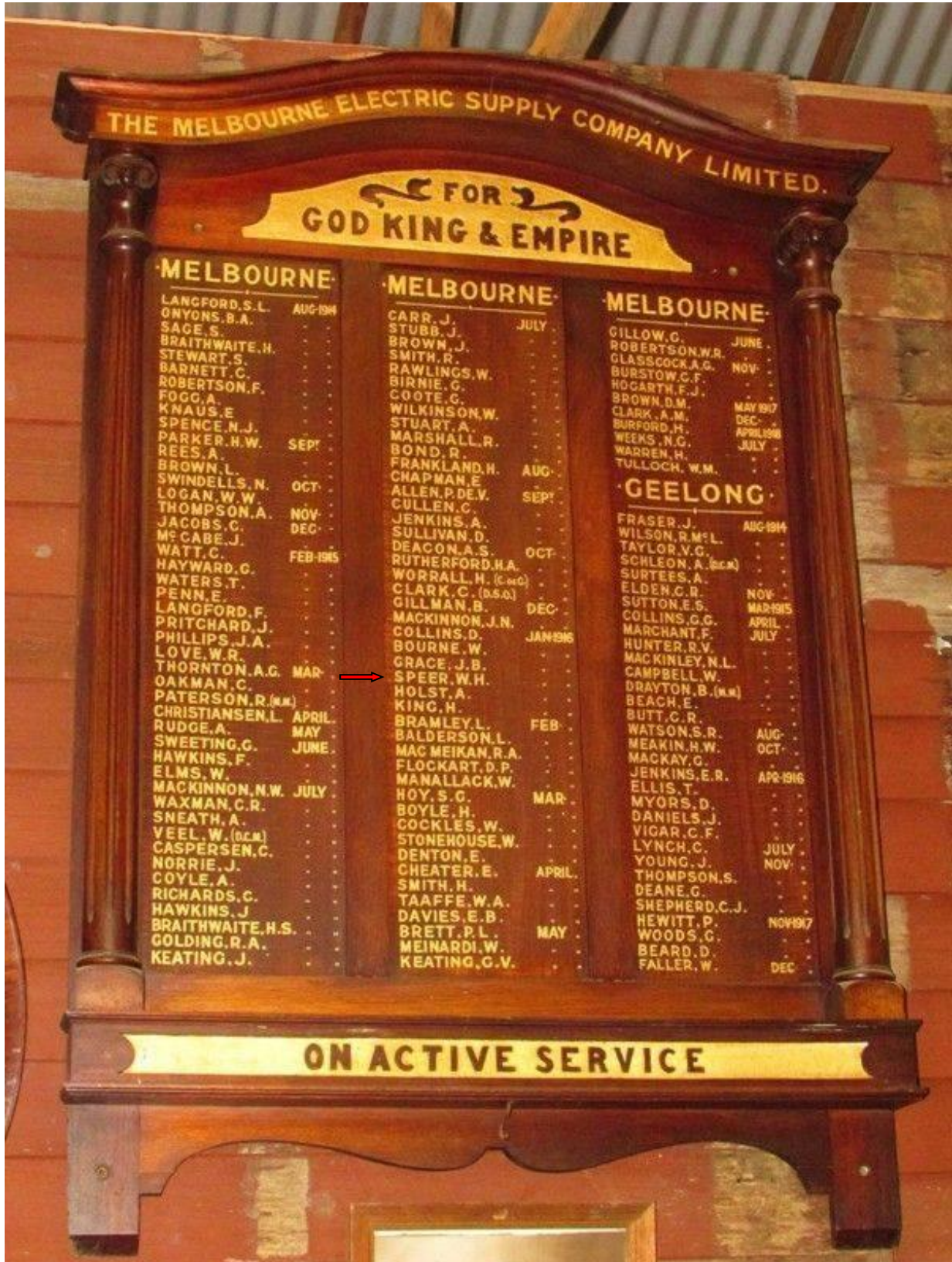
Melbourne Electric Supply Company Limited Honour Roll